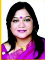
Rotary International District 3291 Governor Shyamashree Sen